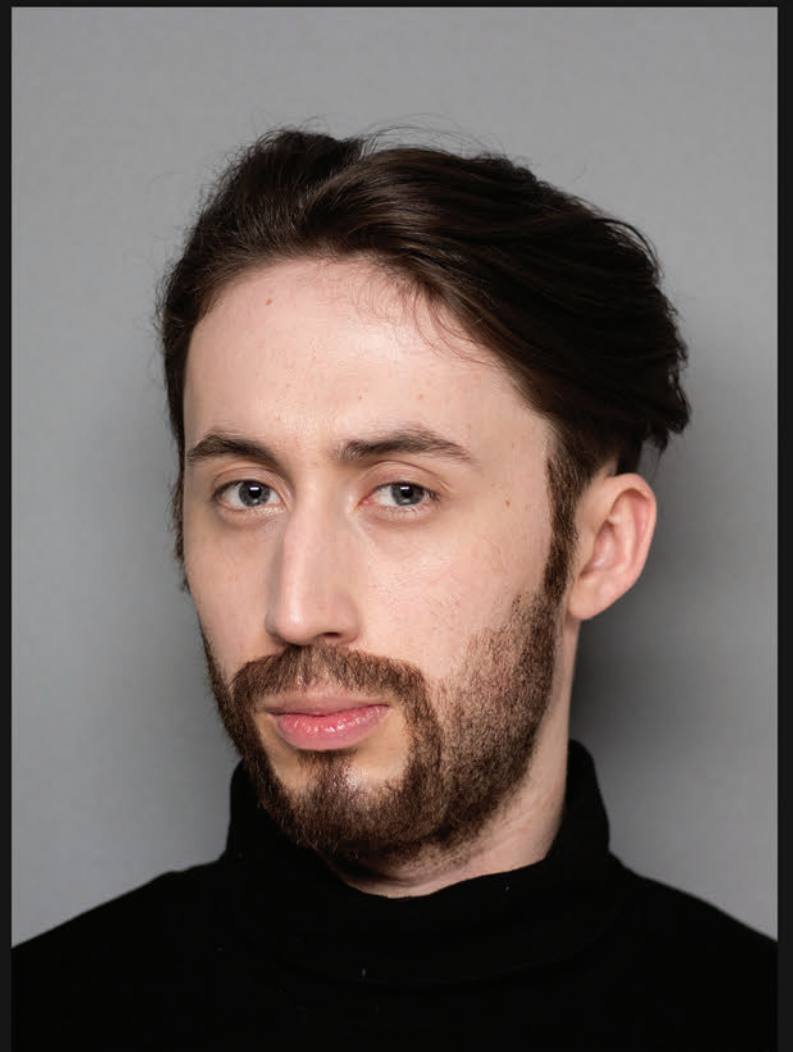
Hand-laid goatee and stubble