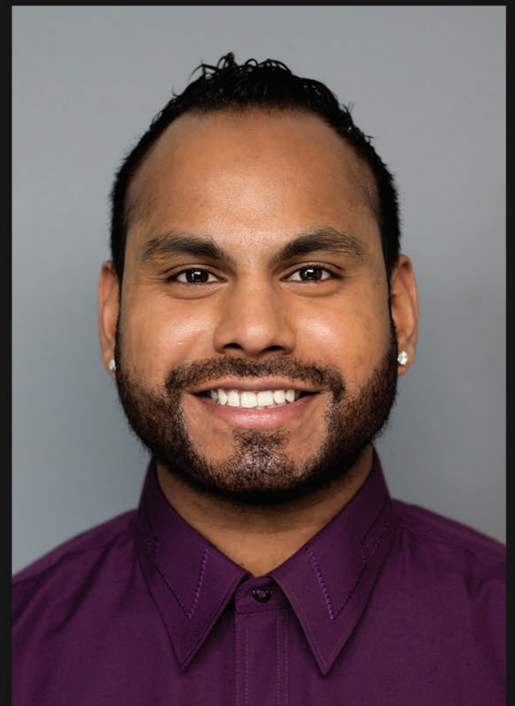
Hand-laid beard stubble