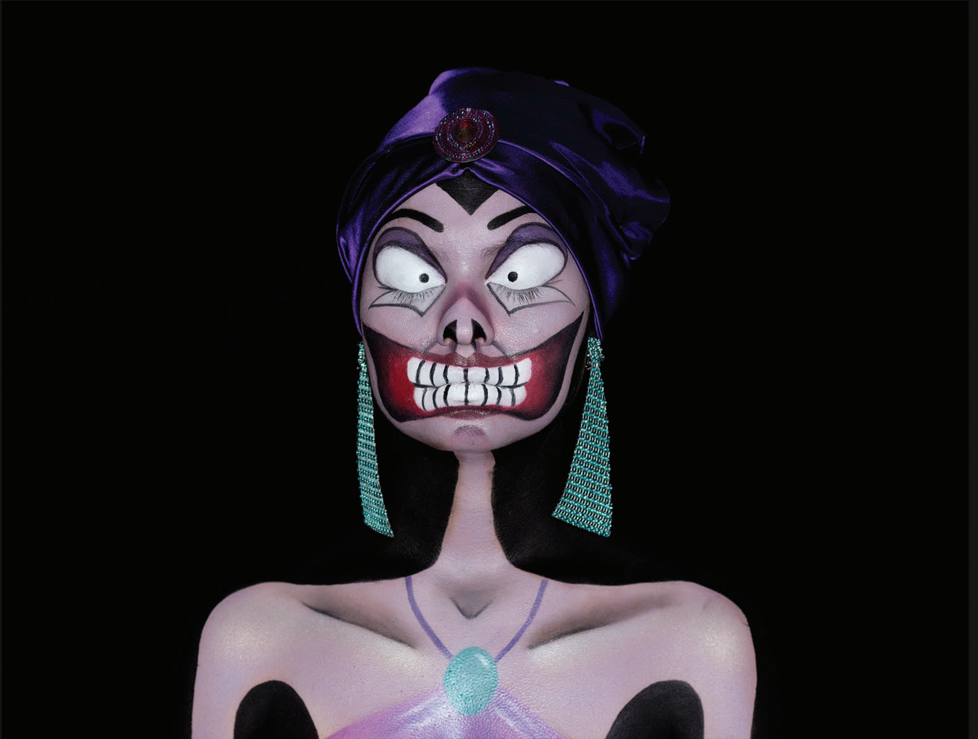
"Yzma" from The Emperor's New Groove : painted illusion makeup inspired by Kika Studios