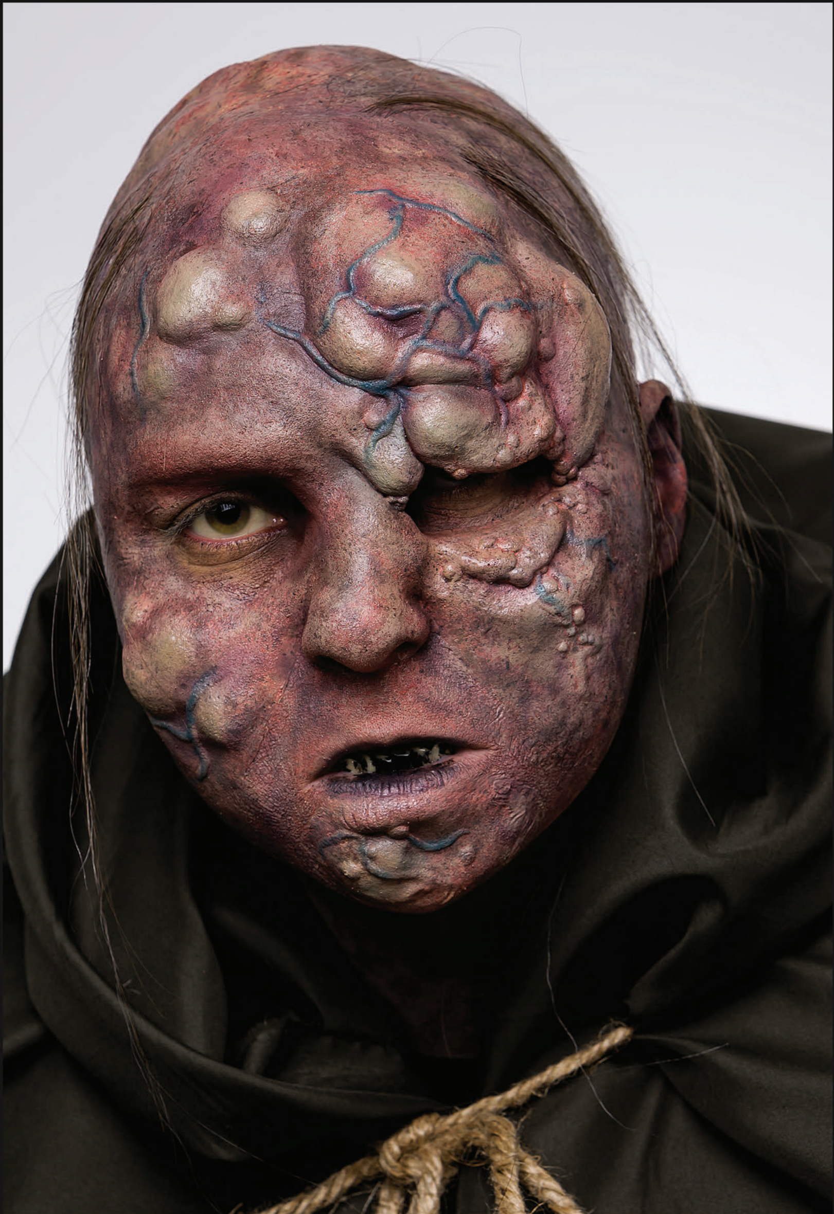
Sculpted, fabricated, and applied, foam-latex prosthetics with fabricated and applied bald cap Sculpt inspired by RBFX