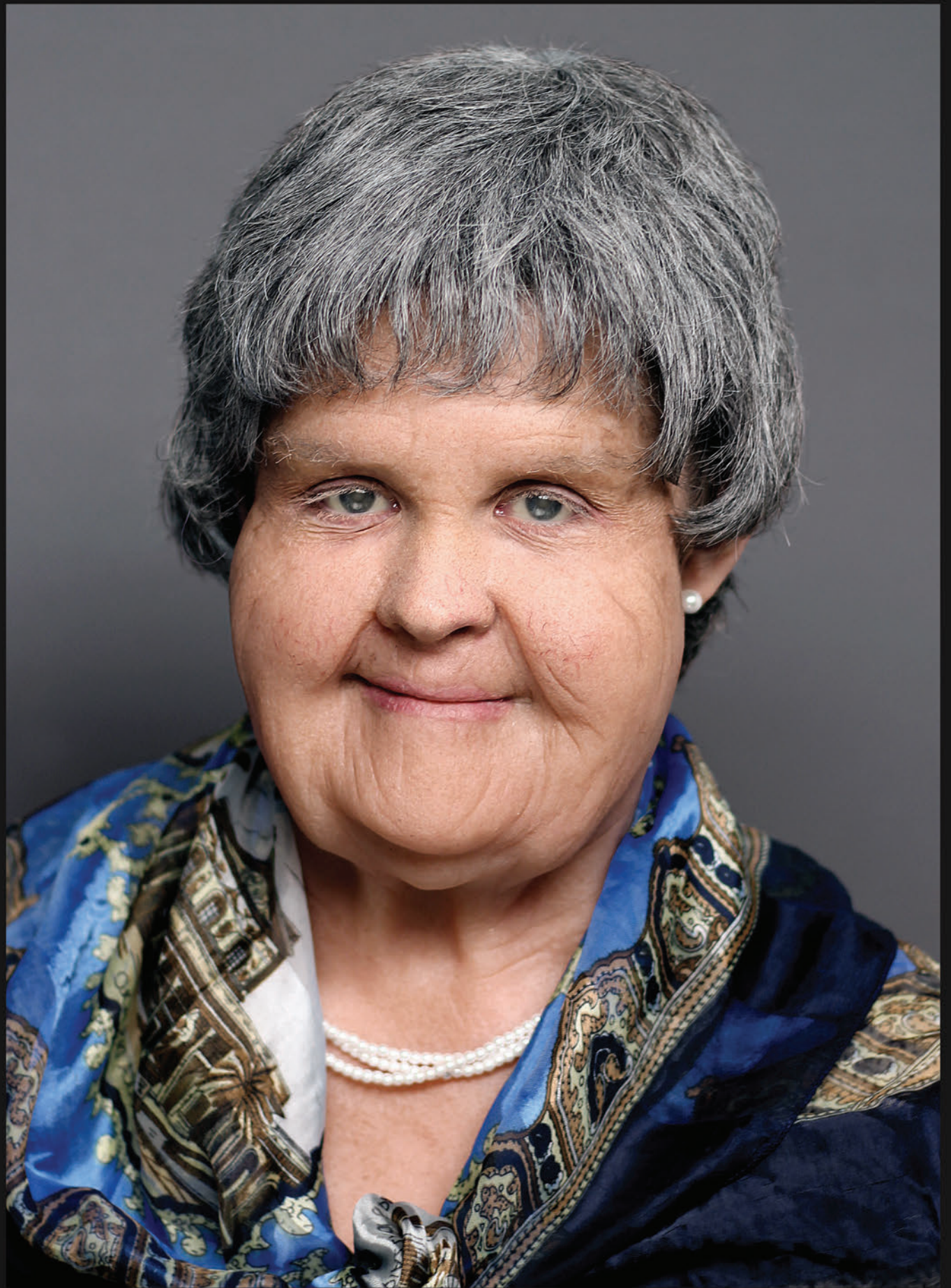
Sculpted, fabricated, and applied facial prosthetics with hand-punched brows