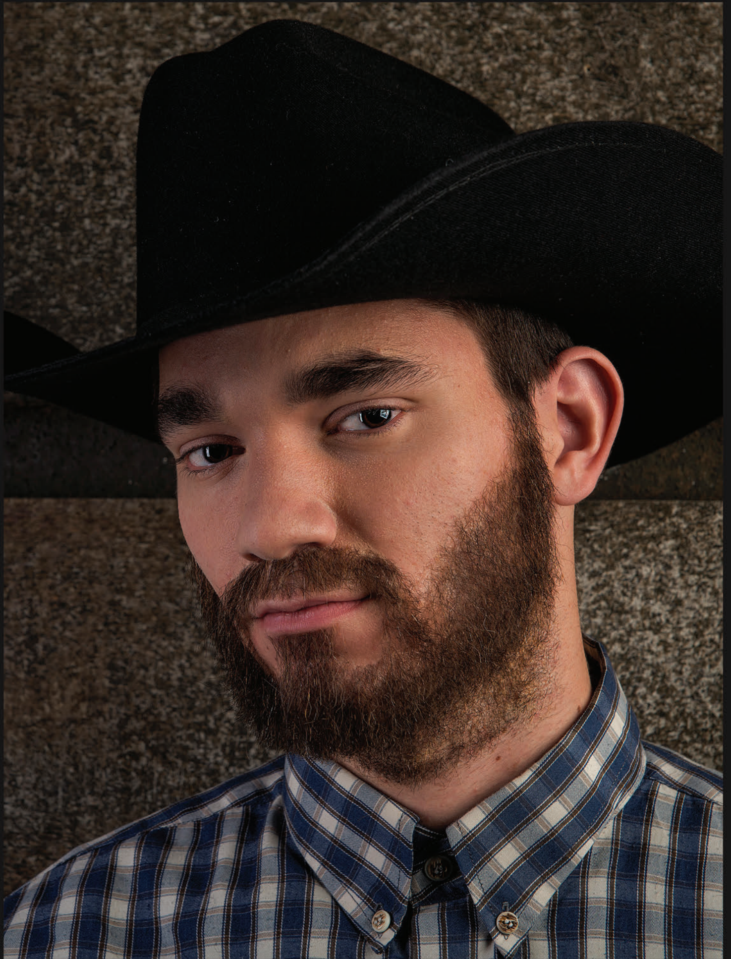
Hand-laid human hair beard