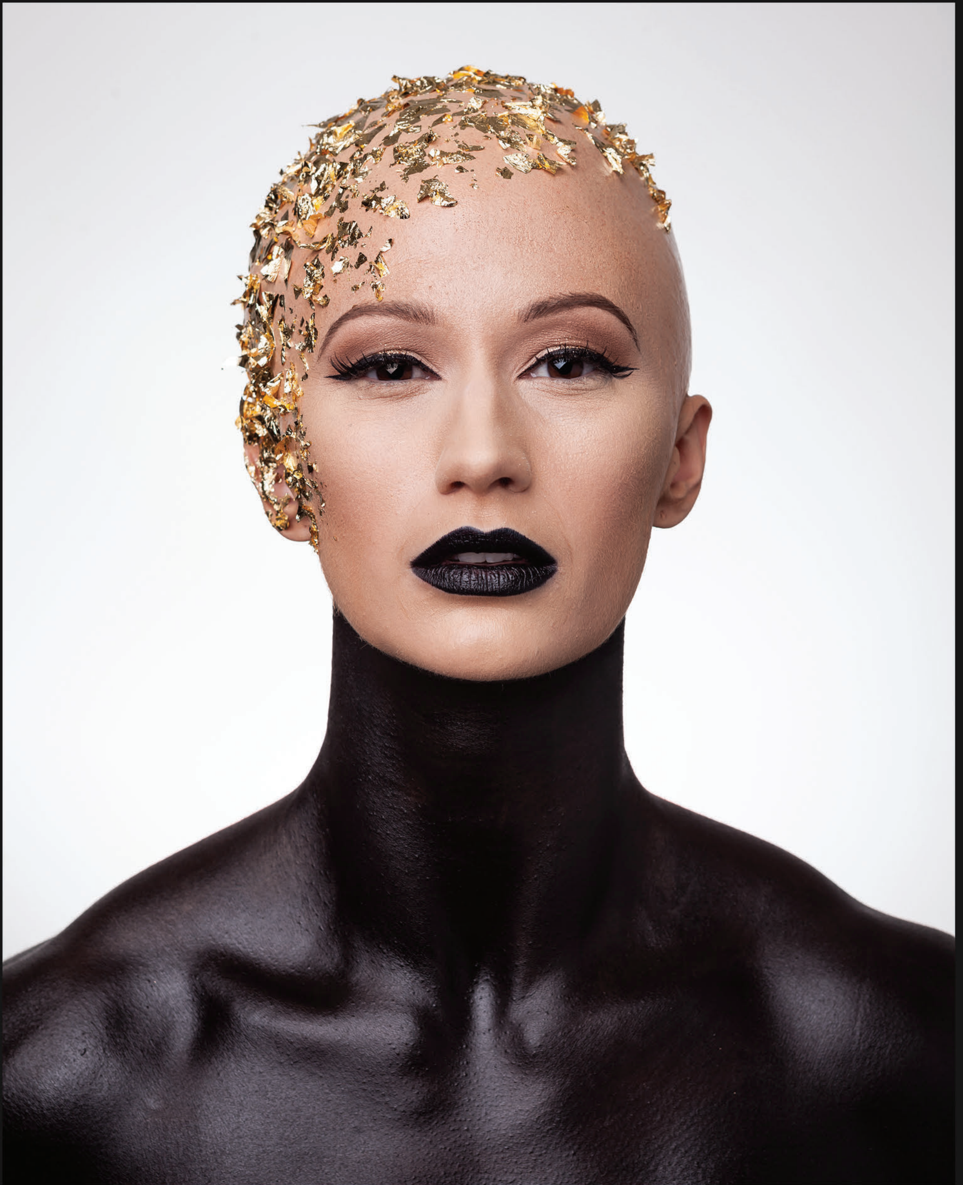
Fabricated and applied bald cap