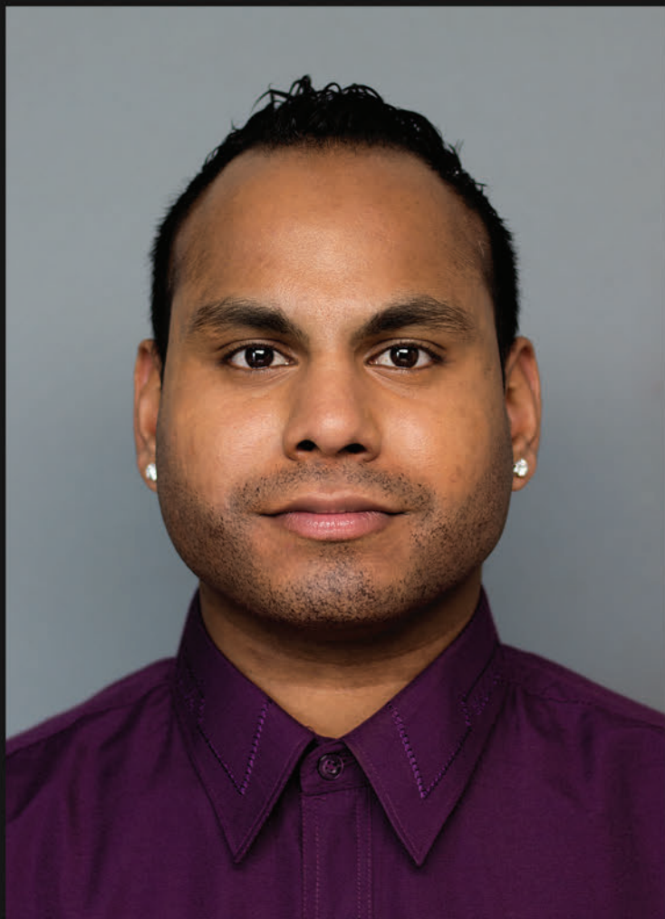
Painted beard stipple